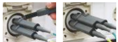
The solution for secure contacts with CES sockets.